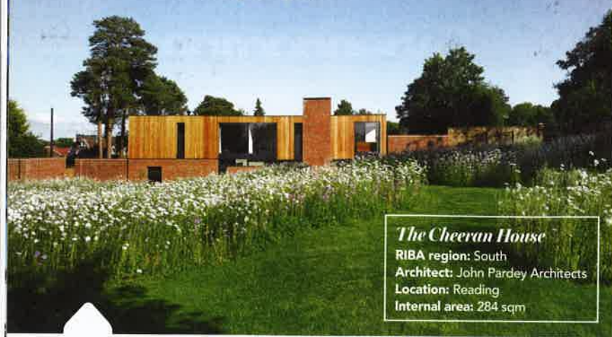
The Cheeran House RIBA region: South Architect: John Pardey Architects Location: Reading Internal area: 284 sqm