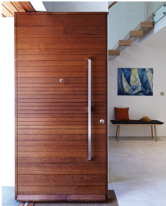
Above: Bold hues and stained glass details are a popular choice. Ludlow door with Quad red glazing, chrome handle and letterplate, £700, Quickslide. Left: Pivot doors work especially well on larger thresholds. Neo E80 doorset in Iroko, 2,400mm (H) x 1,800mm (W) plus boarded panel, £6,500, Urban Front